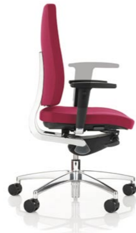
Arm Pad Height