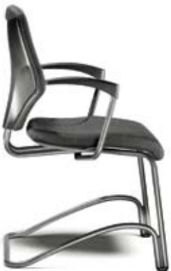
64-7002 Midback Cantilever Armchair