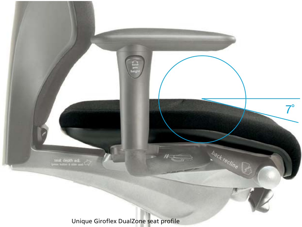
Unique Giroflex DualZone seat profile