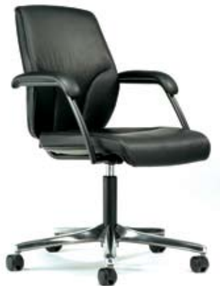
64-9279 Conference Armchair