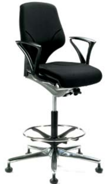
64-7078 Midback Swivel Armchair (with extra height and footing)