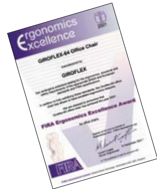
FIRA Ergonomic Excellence Award

Many office chairs are designed for an 'average' person - but who is average? Given the bewildering range of shapes and sizes of the adult working population is it possible to have one chair range to fit all? Giroflex 64 certainly goes further to make this possible with seat depth adjustment function as standard and a choice of seat sizes.