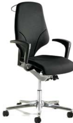
64-7578 Highback Swivel Armchair